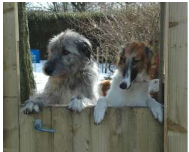
Box-Head and Beauty at the gate.