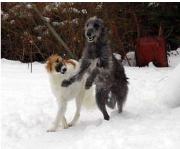
Beauty and me. We start to play!

Of course you get the answers in the Professor's book!