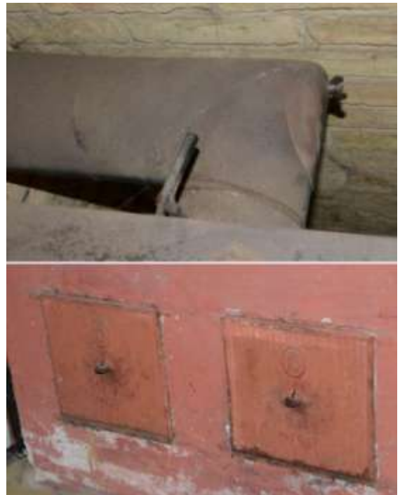
Cleaning hatches and damper

In example 1 the fire is burning properly. The chimney is clean and everything is working fine. The blue arrow shows how oxygen gets into the oven, and the red arrow shows how the combustion gases escape. In example 2 there is a lot of soot lining the chimney walls. Soot is coal dust and it can burn. If the chimney gets hot, and oxygen gets into the chimney, the soot may get on fire and cause a chimney fire. That can cause a house to catch fire. In example 3, there is a blockage in the chimney, a bird has built a nest, yes that actually does happen! Combustion gases cannot escape, and carbon monoxide escapes seeps through cracks and crannies into the house, as the orange arrows show you. The chimney sweep is here to make sure this all works correctly, so you can rest safely in front of the fireplace as I know you like to do! Hey, there is something wrong outside. The chimney sweep calls from up on the roof... What has happened outside, and how will we solve it? Why are we talking about chimneys and fireplaces here in first place?